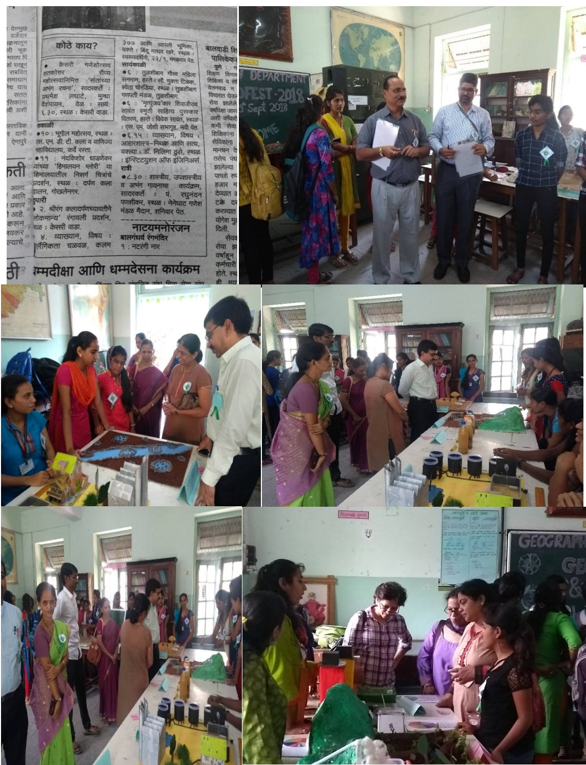
PHOTOGRAPH OF GEOGEST 2018